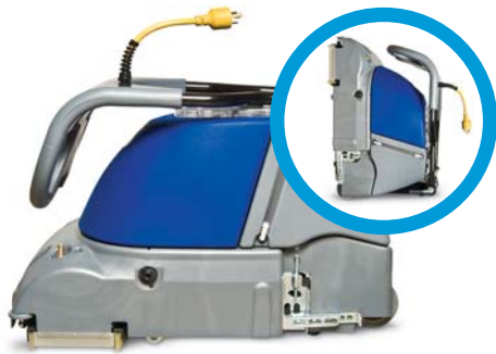
Collapsing handle for easy, compact storage and portability