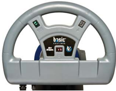
Multi-function ergonomic panel provides ultimate control